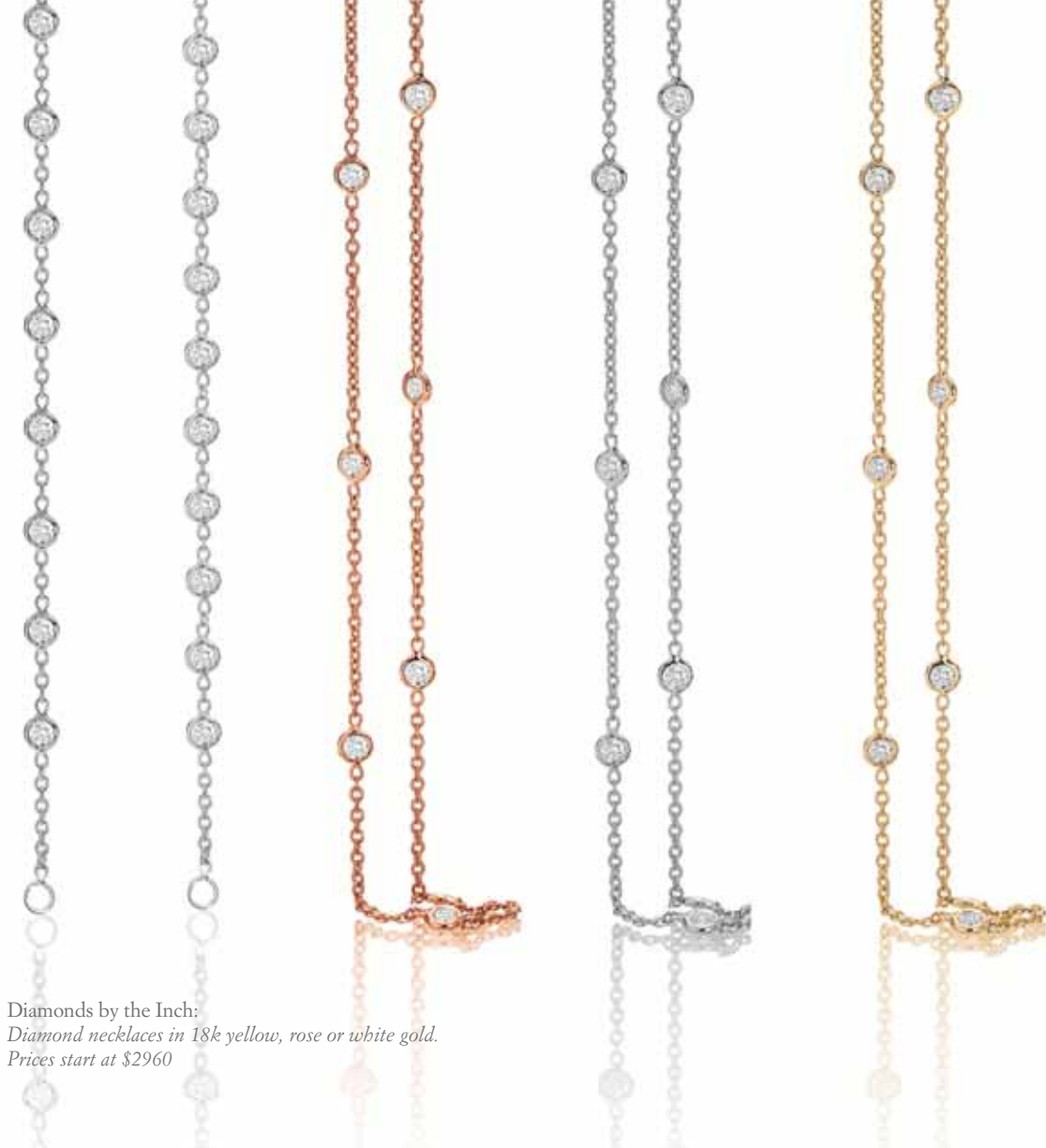
Diamonds by the Inch: Diamond necklaces in 18k yellow, rose or white gold. Prices start at $2960