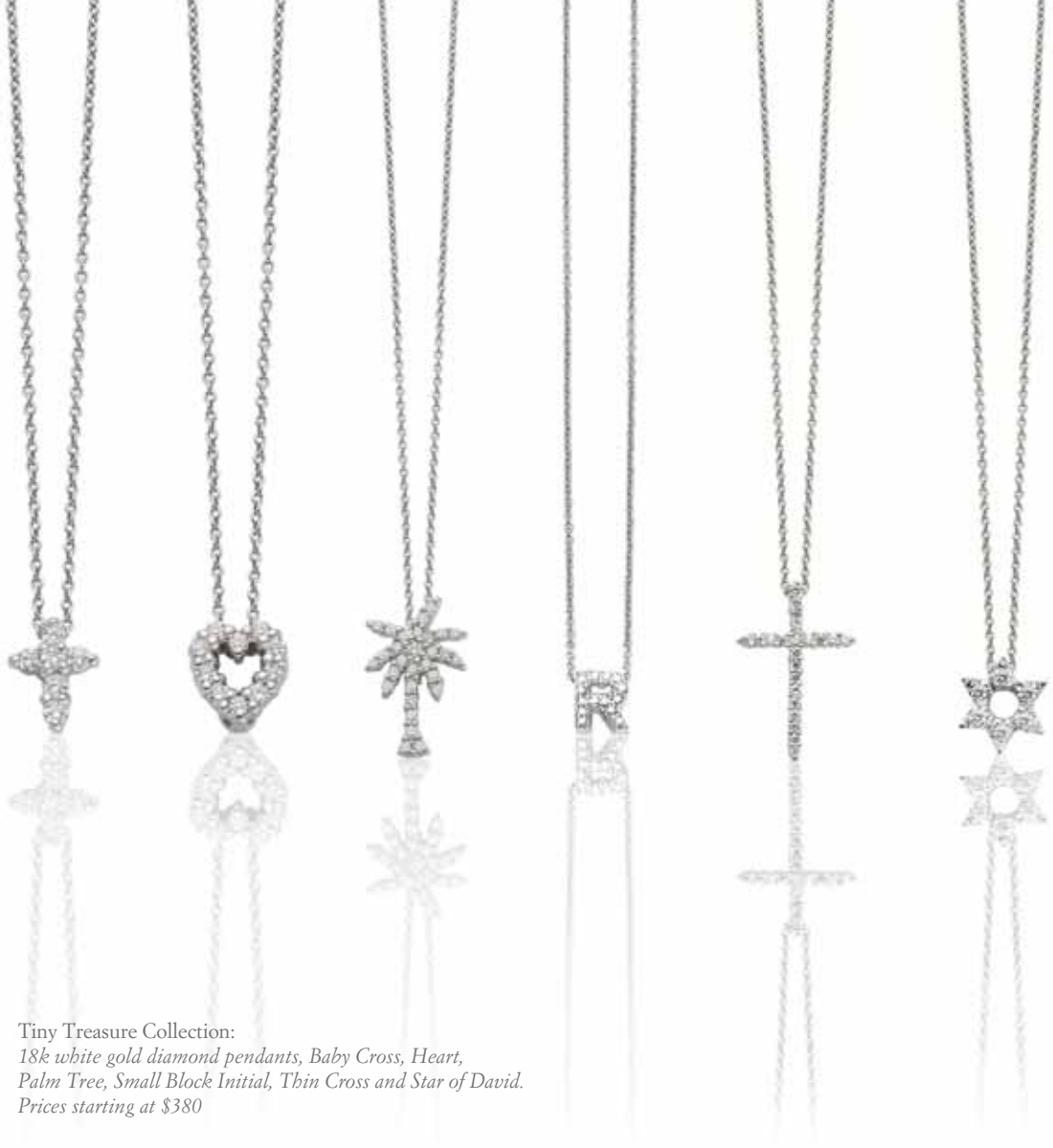
Tiny Treasure Collection: 18k white gold diamond pendants, Baby Cross, Heart, Palm Tree, Small Block Initial, Thin Cross and Star of David. Prices starting at $380