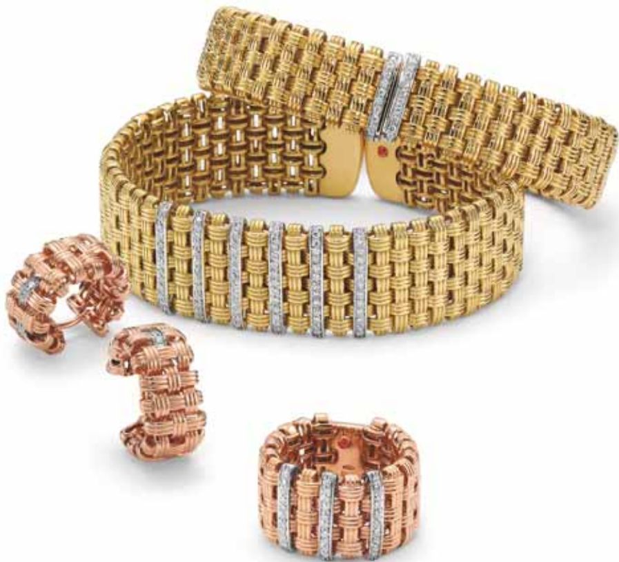
Appassionata Collection: Bangles in 18k yellow gold with diamonds. Earrings and ring in rose gold with diamonds. Prices starting at $1820