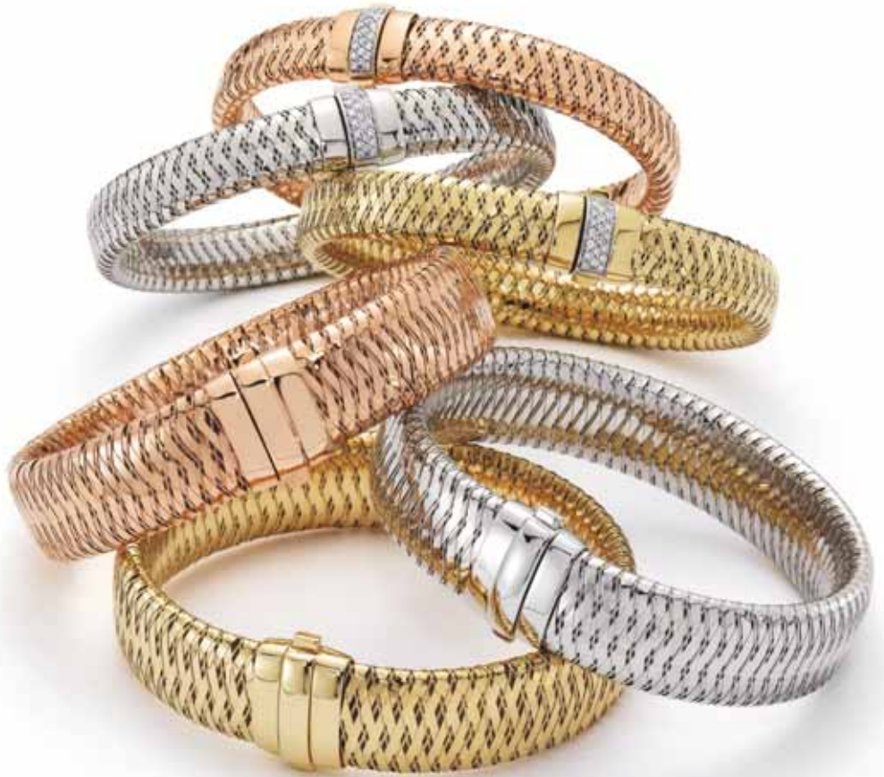
Primavera Collection: Bracelets in 18k rose, white or yellow gold with or without diamonds. Prices start at $2200