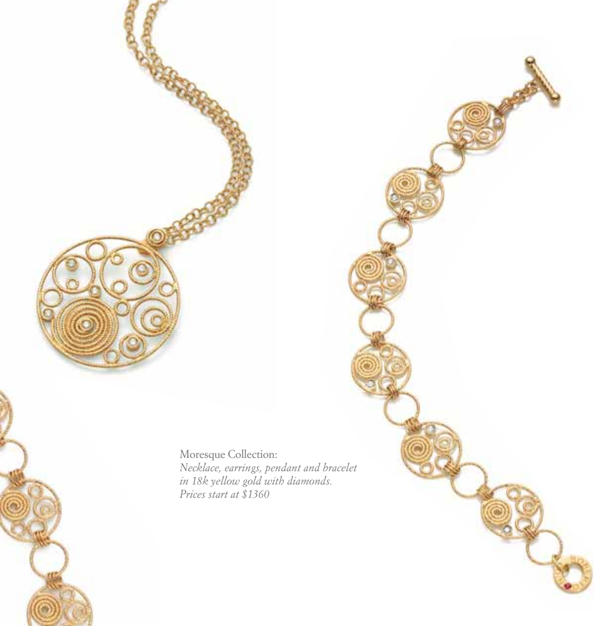
Moresque Collection: Necklace, earrings, pendant and bracelet in 18k yellow gold with diamonds. Prices start at $1360